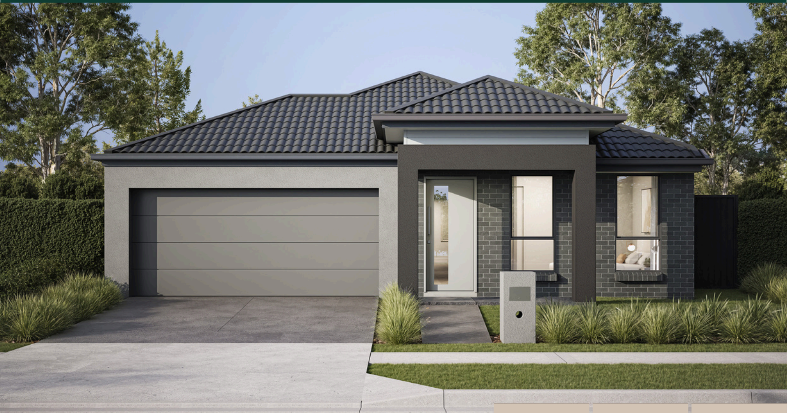
Image is for illustrative purposes only and may depict upgrade options and other items not supplied by Creation Homes.